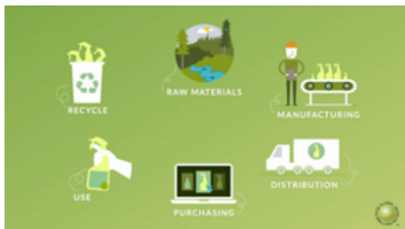
Fig. 1. Lifecycle ecolabels

Criteria must cover an entire lifecycle, including when products are produced, used, and end of life. They can be managed or owned by independent third-party bodies that may involve not-for-profit, government agencies, or private sector organisations. Approximately 37 type 1 lifecycle ecolabels are members of the Global Ecolabelling Network (GEN).